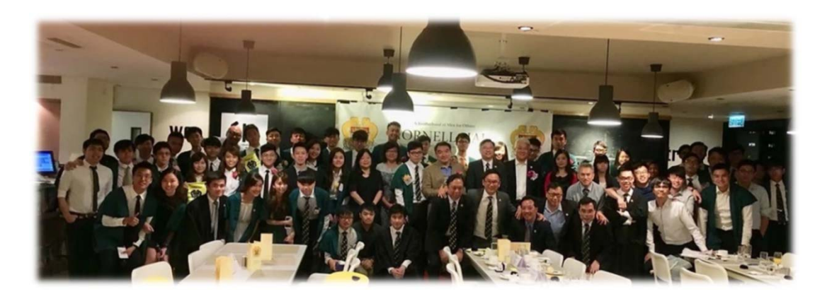
High Table Dinners